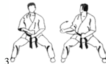
3 URAKEN HIZO UCHI right