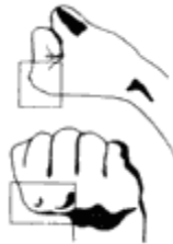
URAKEN (INVERTED FIST) Strike with the first 2 knuckles