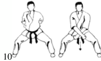
SEIKEN JUJI UKE JODAN