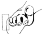
SOKUTO KNIFE FOOT (ASHIGATANA)