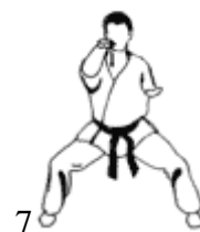
7 YONHON NUKITE JODAN right