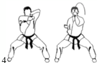
4 URAKEN OROSHI GANMEN UCHI left