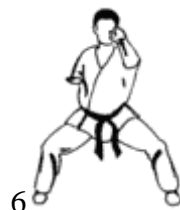
6 NIHON NUKITE (ME TSUKI) left