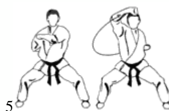
5 URAKEN MAWASHI UCHI right