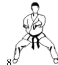
8 YONHON NUKITE CHUDAN left