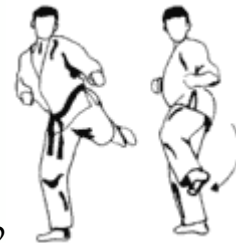
MAWASHI GEDAN GERI HAISOKU right